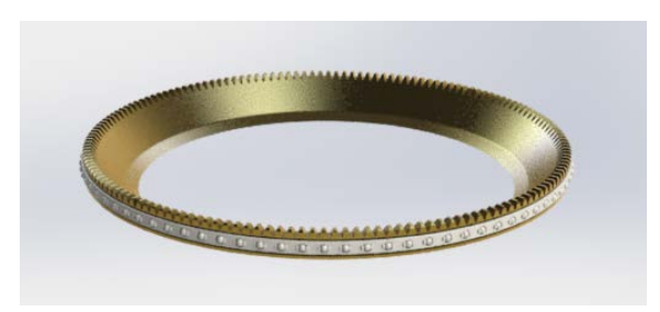
Figure 1: Picture of Old AMD Blade

For your convenience a picture is provided below with the Old AMD blade and the New AMD Blade.